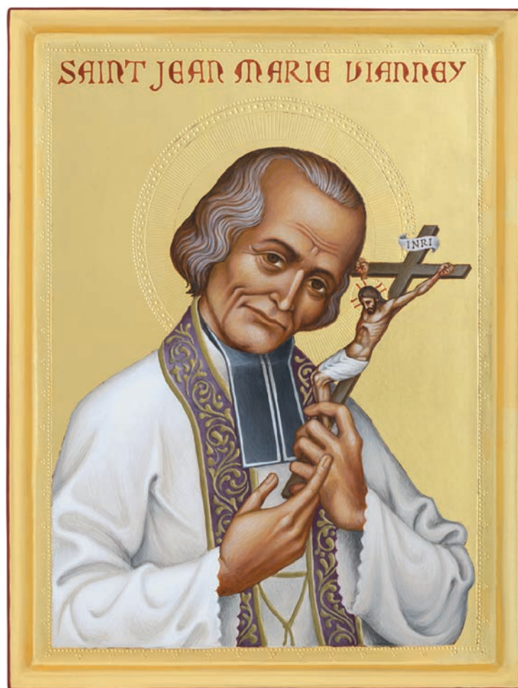
The holy Curé d'Arles is depicted holding and pointing to a crucifix, indicating that Christ is the center of his life. Icon by Fabrizio Diomedi, commissioned by the Supreme Council (2018).