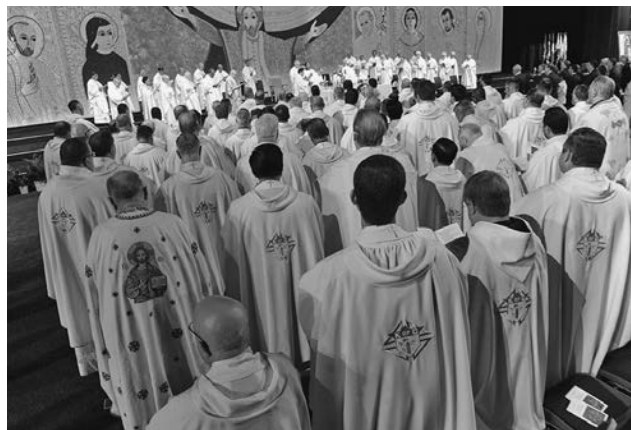
Priests from K of C jurisdictions throughout the world join in celebrating Mass at this year's convention in St. Louis.