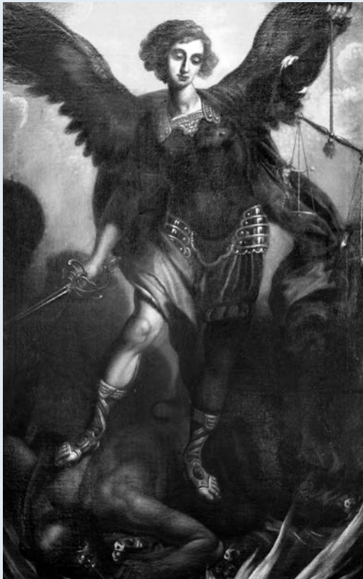
St. Michael the Archangel

1 Columbus Plaza, New Haven, CT 06510-3326