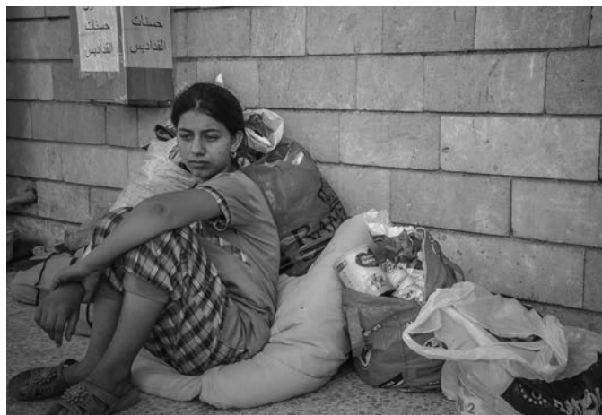
A young Syrian girl sits with her belongings at a refugee camp in Erbil, Iraq. Erbil was once home to thousands of Christians now living in camps or inadequate makeshift shelters, which will provide little protection as winter approaches.