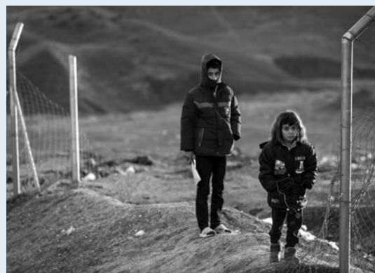
Children stand on a hill outside the refugee camp they call home near Erbil, Iraq. Their situation is similar to that faced by nearly all Christians in the Middle East since ISIS launched its offensive in 2014.

Encourage Knights to spread the word of the crisis among their communities — ask them to distribute informational materials from the USCCB, found at usccb.org . They should also provide details on how to donate to the Christian Refugee Relief Fund.