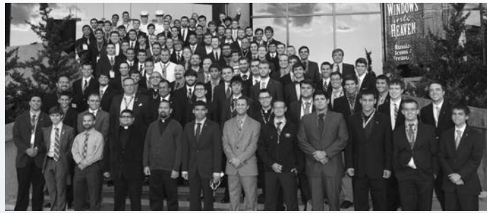
More than 120 college Knights from over 60 campuses across North America came to New Haven, Conn., for the 2013 conference.

"Are we fundamentally men of charity, men of self-gift and mercy to