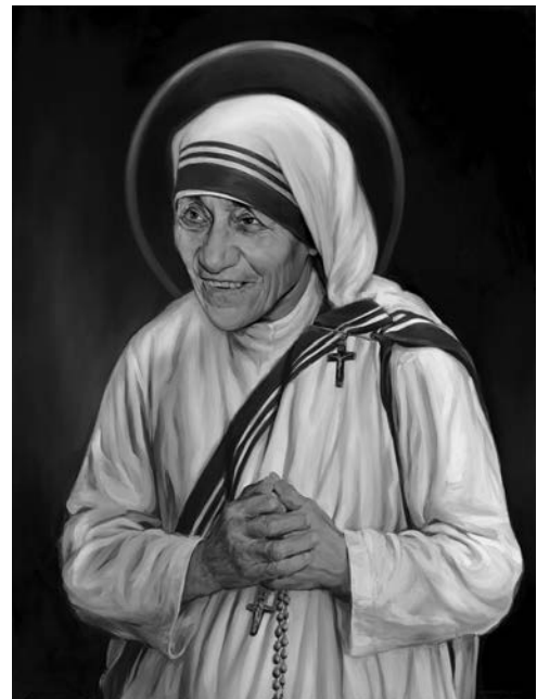
Painting by Chas Fagan