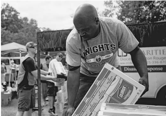
A Knights of Columbus volunteer carries a box of supplies to aid recovery and cleanup efforts, Baton Rouge, La.

The Knights of Columbus has a long history of lending a helping hand in times of distress.