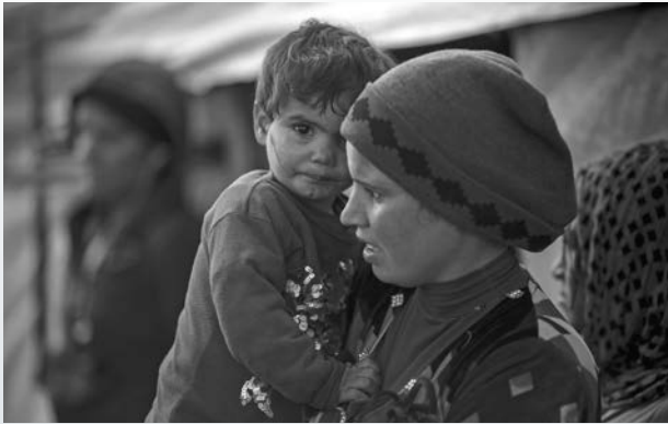
A young Syrian mother who was displaced by violence holds her 2-year-old child outside their tent at an informal settlement in Deir al-Ahmar, in Lebanon's Bekaa Valley.

The Knights of Columbus recently contributed almost $2 million to various aid programs in the Middle East that have received little to no funding from the U.S. government or international community since ISIS began its genocidal campaign against the region's religious minorities in 2014.