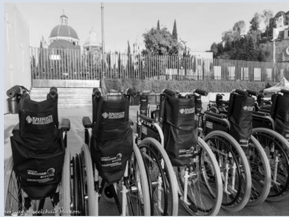
A row of wheelchairs just before a distribution in Mexico City, Feb. 22, 2016.

The Global Wheelchair Mission, a partnership of the American Wheelchair Mission and the Canadian Wheelchair Foundation, changes the lives of children and adults each day.