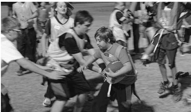
Aside from meeting the professional football players, the Special Olympic athletes also participated in a flag football game.

Seahawks tight end Luke Willson experienced firsthand the joy of the Special Olympics athletes during a football skills clinic and flag football game at Nozomi Park in Chandler, Ariz., sponsored by the Arizona Knights of Columbus, Arizona Special Olympics and Catholic Athletes for Christ.